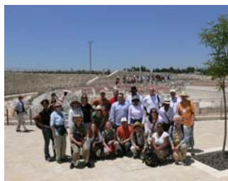
May 2008 Study Tour Group in Jerusalem

foremost concern. The situation is monitored constantly and updates are provided by YMCA colleagues in Jerusalem.